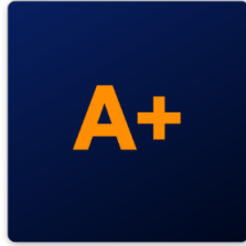
Grading / Feedback